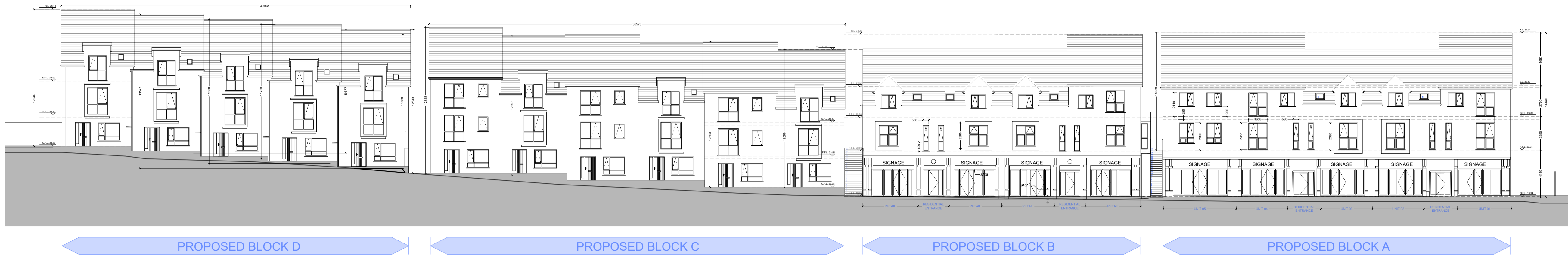
CONTEXTUAL ELEVATION (CE-1) 1:200@A1