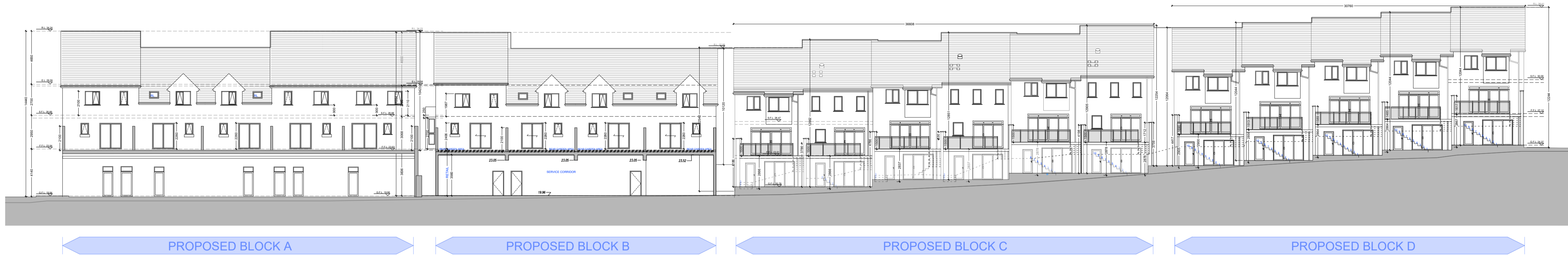
CONTEXTUAL ELEVATION (CE-2) 1:200@A1